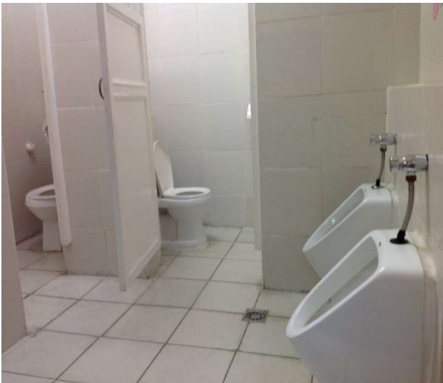
Boys Comfort Room