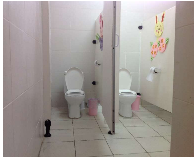
Girls Comfort Room